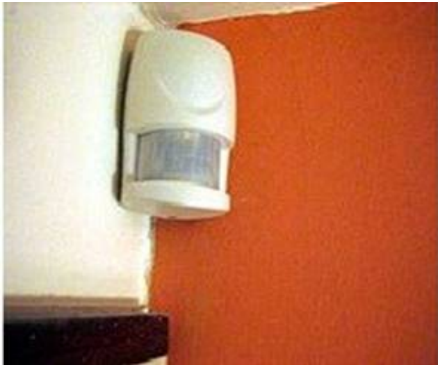
C:\Users\MCS\Desktop\1.jpg Passive Infrared Sensor

These types of sensors are designed for indoor use. Outdoor use would not be advised due to false alarm vulnerability and weather durability. Passive infrared detectors